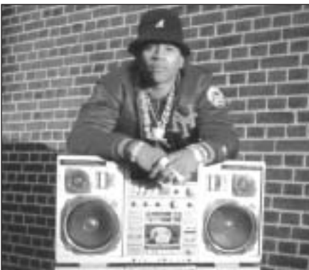
Mama said don't touch LL's radio.

The KUGN controversy goes hand in hand with the University's attempts to brand the University "O" insignia onto