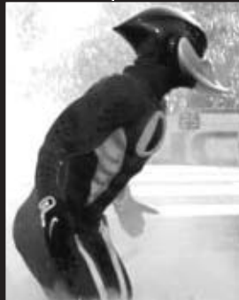
Man-Drake Flaming Symbol Of New Marketing Push