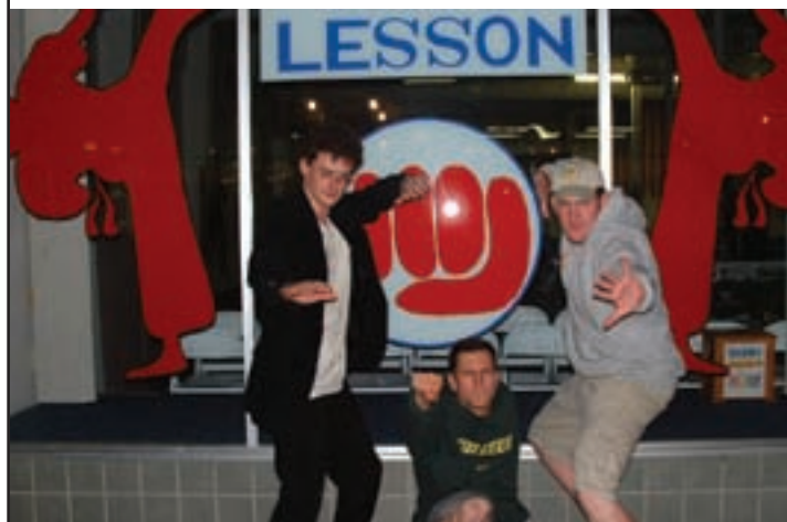
Below: These fellas are the G's the little homies wanna be like. OC OG's gonna kick some ass!