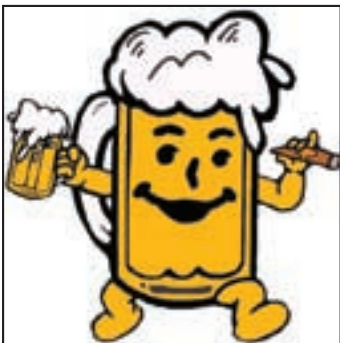
SUDSY: COMMENTATOR MASCOT, REFRESHING BEVERAGE.

On September 27, that lovable glass of booze and official OC mascot Sudsy turned 21 years of age. The well-known bipedal mug of beer had been planning all year for his birthday festivities. “Jesus fuck, I can’t wait!” an obviously excited Sudsy declared. “Can you even comprehend how difficult it is being a walking, talking, cigar-chomping mug of beer that can’t buy beer? I’m a mug of beer for God’s sake! It’s not like I can shoulder tap bums down in the park; they’ll try to drink me.”