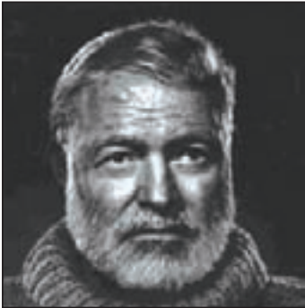
ERNEST HEMMINGWAY: ALCOHOLIC, AUTHOR, DECEASED.