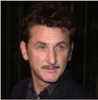
SEAN PENN: FAMOUS MAL-CONTENT AND ALCOHOLIC. PART-TIME ASSAULTER OF JOURNALISTS.