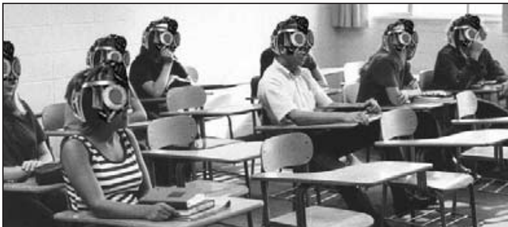
A typical class at the University of Oregon. Sure, they will turn you into an incoherent liberal dunderhead, but at least we get cool headgear.

wake up by the EMU, the dorms or a fountain, just repeat steps one through four until drunken ambition leads you to your calling. Important decisions like this cannot happen overnight, but it will all be worth it when you graduate with your chosen major and go off into the world to get a job in a field that has no fucking relation whatsoever to the mindless drivel you learned in college.