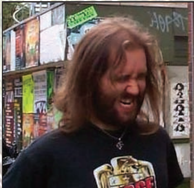
In this jungle, you're not going to find any cute little monkeys or apes. No, you're just going to find jerks like this guy. They're dirty, they're unshaven, and they look like vagrants. Hell, most of them probably are vagrants. Leave now or you'll be pretty God damn sorry in a year or

as well just skip the whole first week, or term, whatever. It's not going to get any better, so you should really just start drinking at noon on day one and not quit until you've either died or made it through to a college degree, whichever comes first.