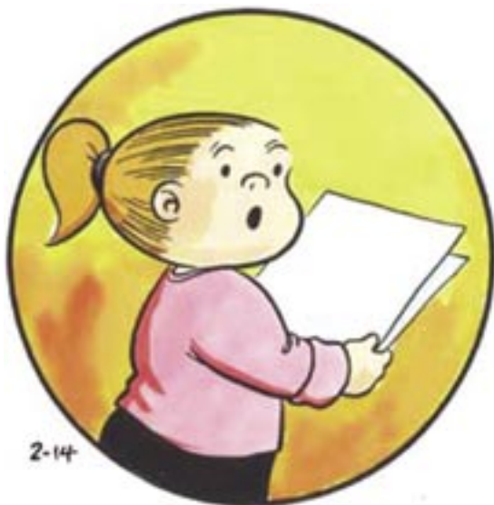
Left: Ward Churchill's painting "The Edification of a Little Eichman", purportedly lifted from an unknown source.