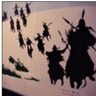
Below: "Winter Warriors", by Ward Churchill. The resemblance is striking.